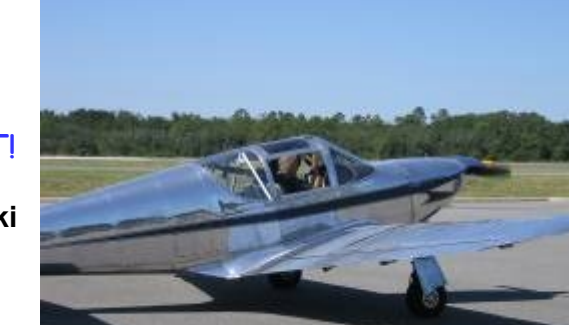
AND I WAS NEXT!